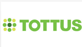
TOTTUS (Chile & Peru)