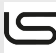
LASTRADA FASHION NY LLC (US)